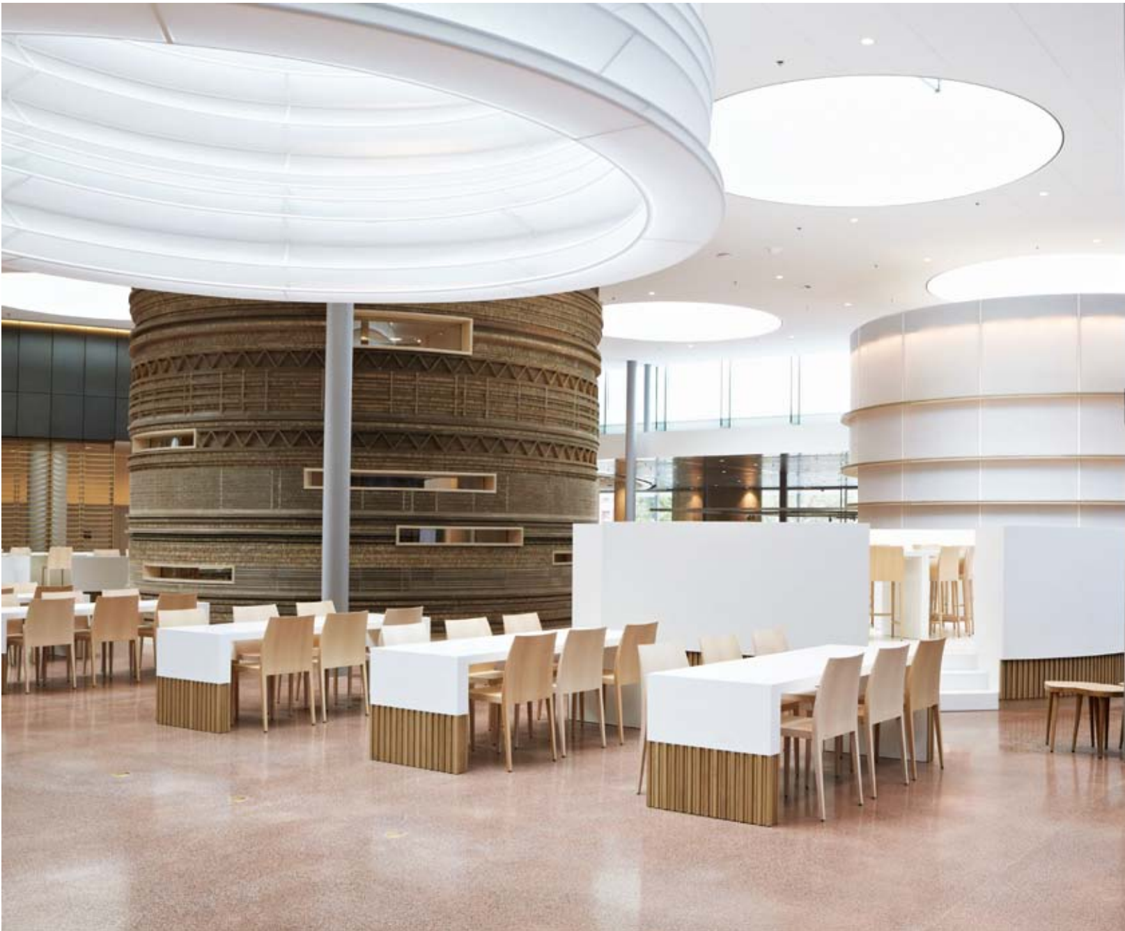
Ellen Sander used cardboard of varying thicknesses for her meeting-room pavilion. She also designed spiralling enclosures and lanterns.