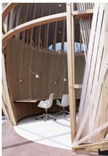
Emma Architects designed nestlike meeting pavilions made from timber harvested in the Netherlands.